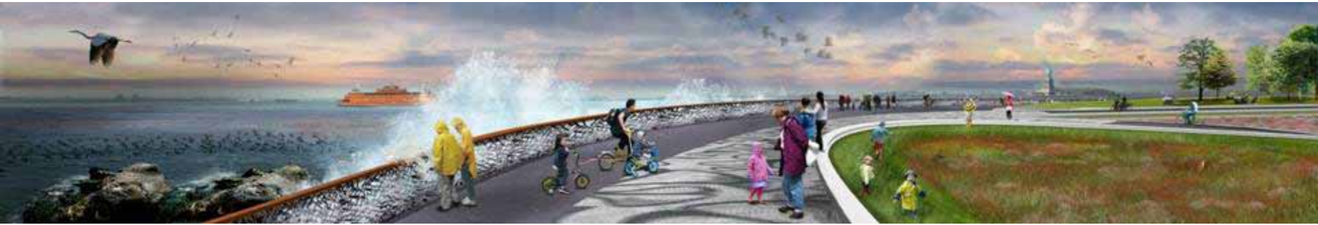
WETLAND GARDENS AND THE GREAT PROMENADE BRING VISITORS CLOSE TO NEW YORK HARBOR