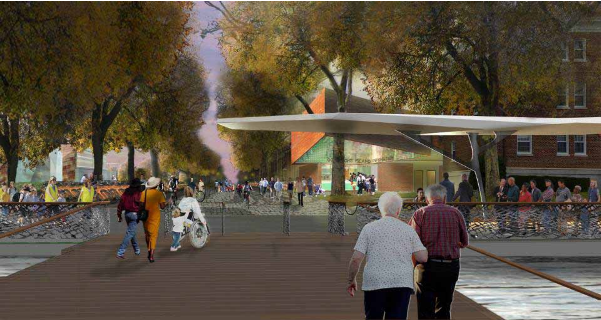
VISITORS ARRIVE AND LEAVE AT YANKEE LANDING