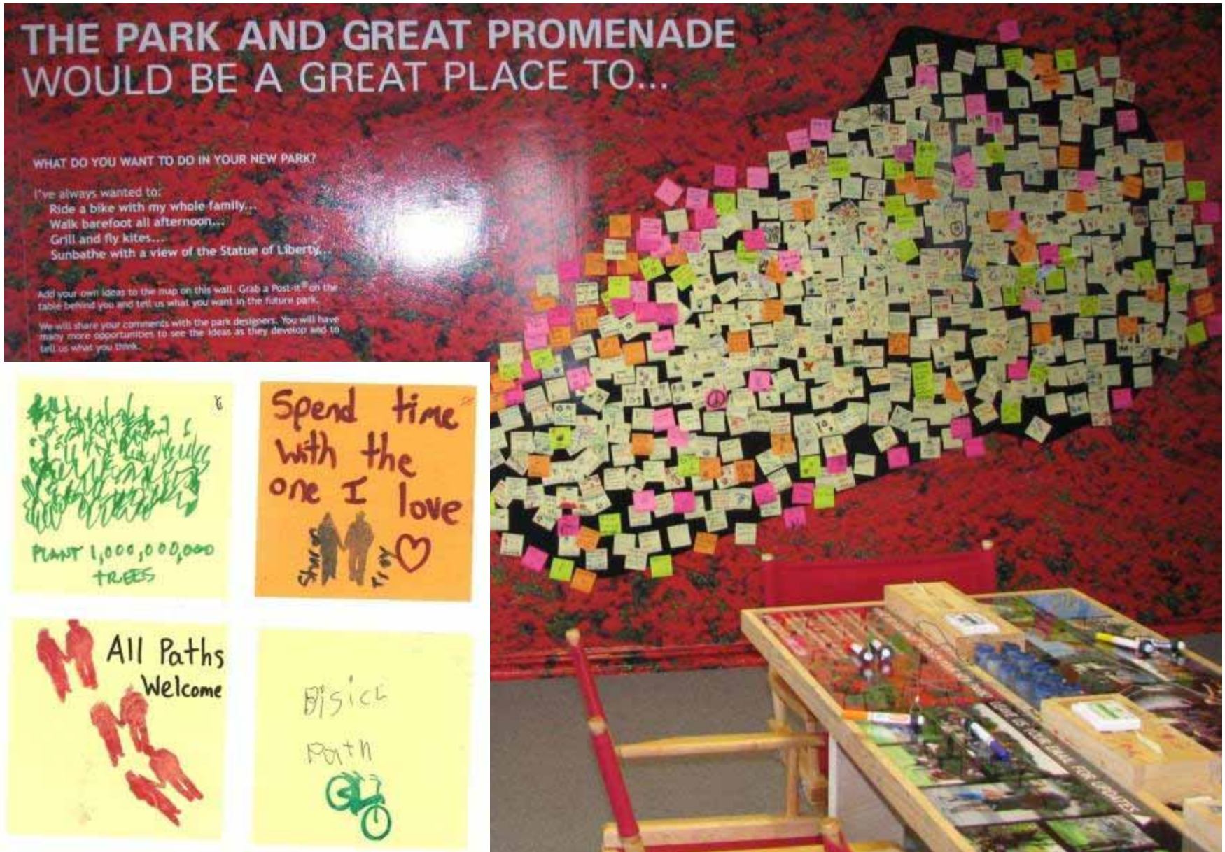
PUBLIC INPUT WITH POST-IT® NOTES