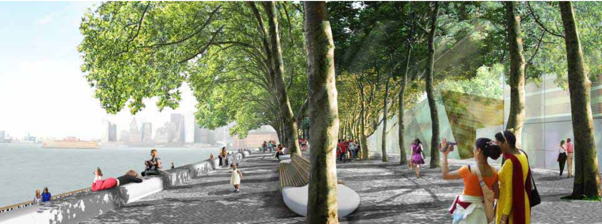
THE WESTERN PROMENADE - UPPER LEVEL - HAS AN OPEN VIEW AND SEATING UNDER SHADE TREES