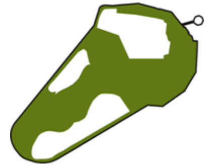
PHASE 3 COMPLETE PARK AND PUBLIC SPACE SOUTH OF DIVISION ROAD