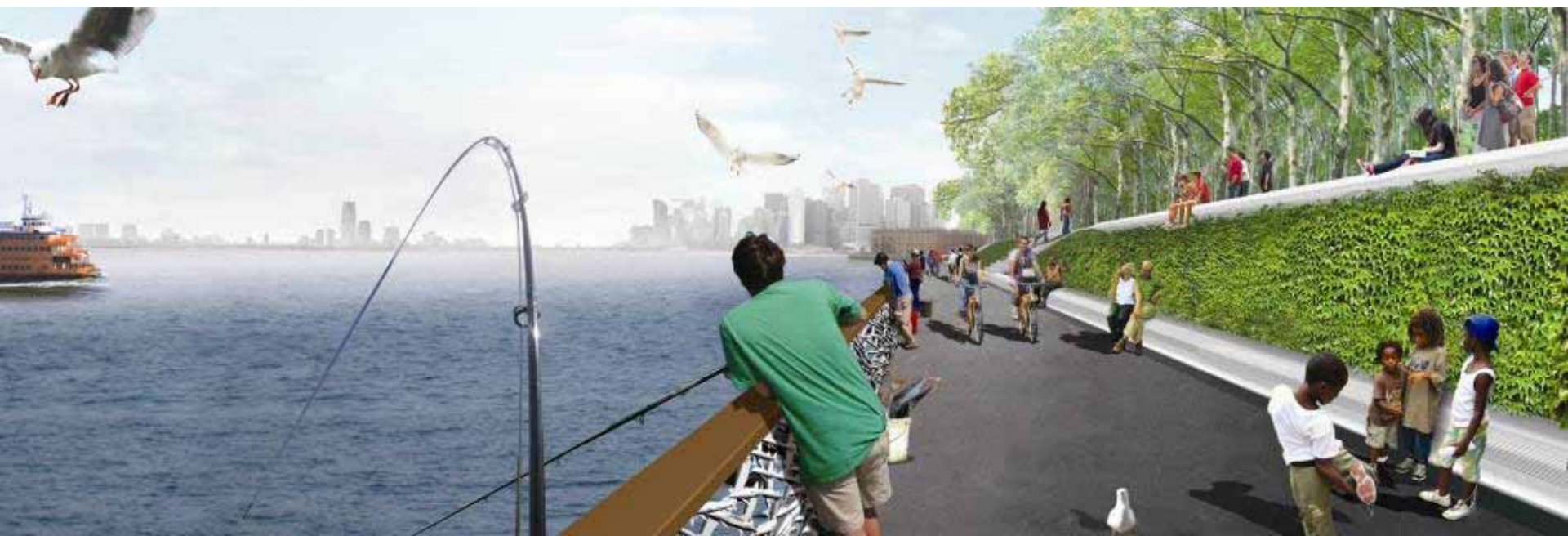
THE WESTERN PROMENADE - LOWER LEVEL - HAS SPECTACULAR VIEWS CLOSE TO THE WATER