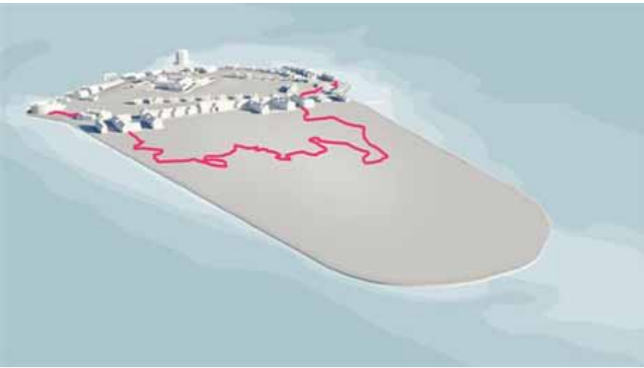
100-year flood line today