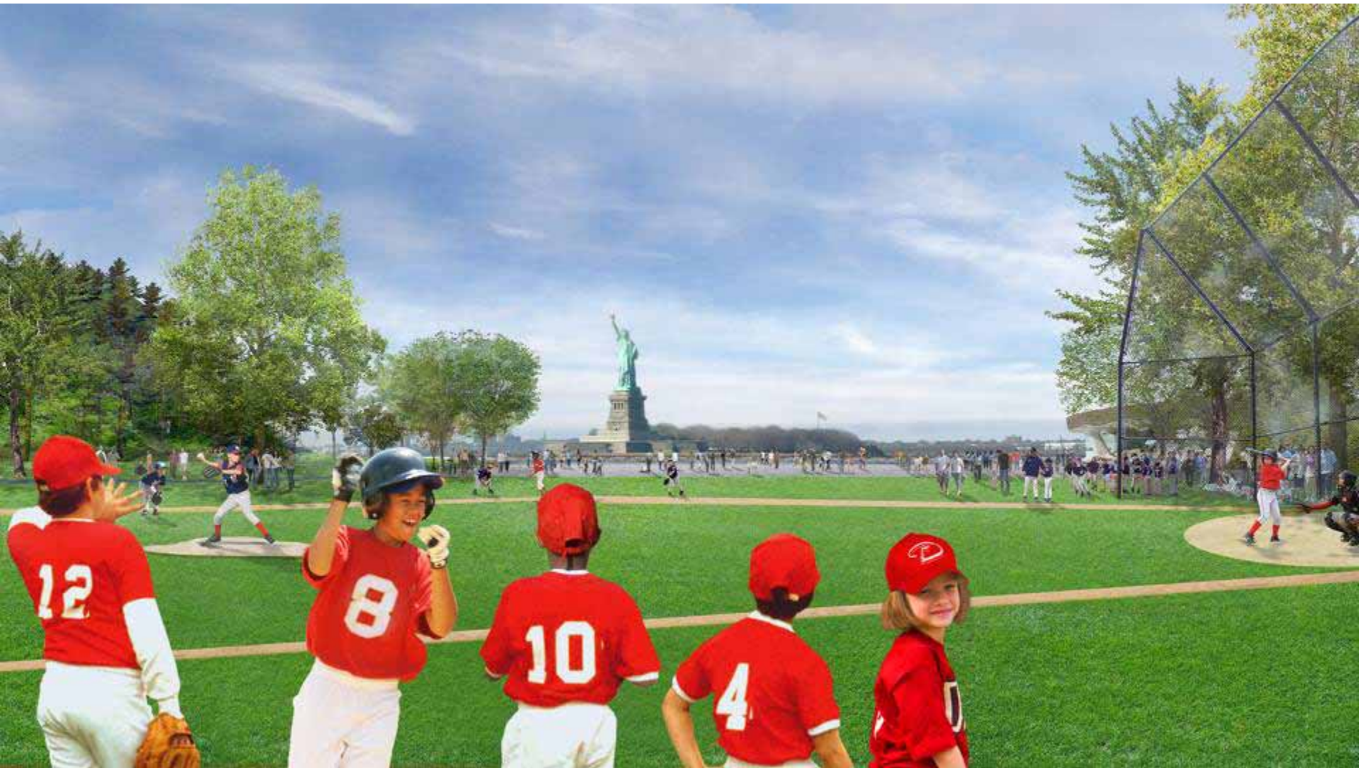
BALL PLAYERS AND SPECTATORS HAVE AN AMAZING VIEW OF THE STATUE OF LIBERTY