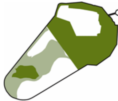
PHASE 2B FINISH HILLS, GRADING & UTILITIES AT LAWN AND HAMMOCK GROVE