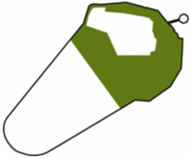
PHASE 1 COMPLETE PARK AND PUBLIC SPACE NORTH OF DIVISION ROAD