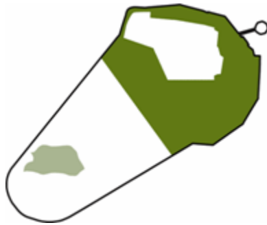
PHASE 2A HILL PRELOADING, UTILITY DIVERSION