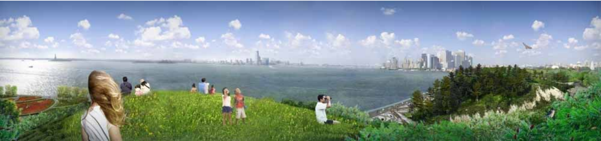
360-DEGREE VIEWS FROM THE TOP OF THE HILLS