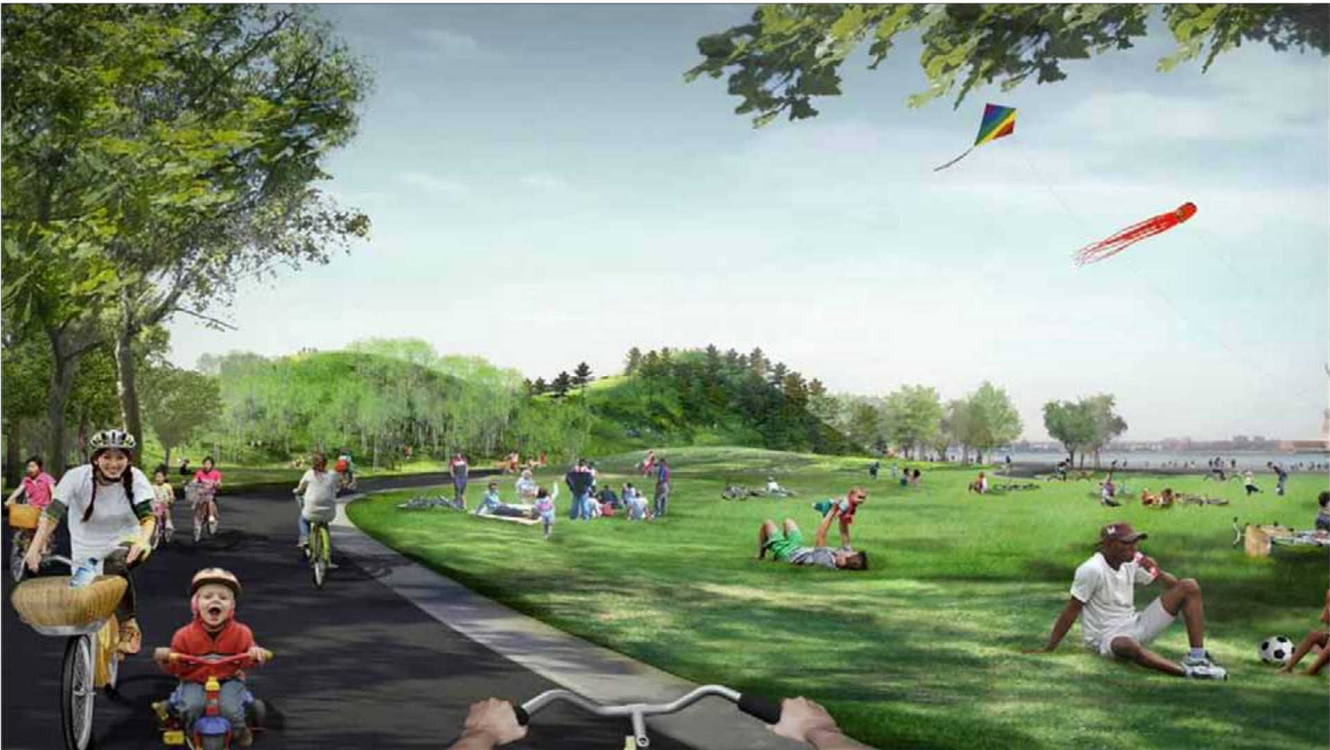
BICYCLISTS AND PICNICKERS ENJOY THE OPEN SPACES OF THE PLAY LAWN