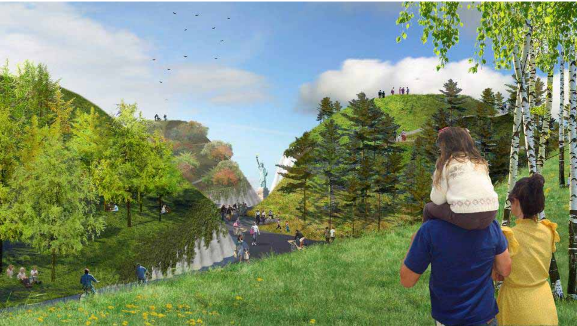
THE HILLS DRAW VISITORS TOWARDS THE HARBOR