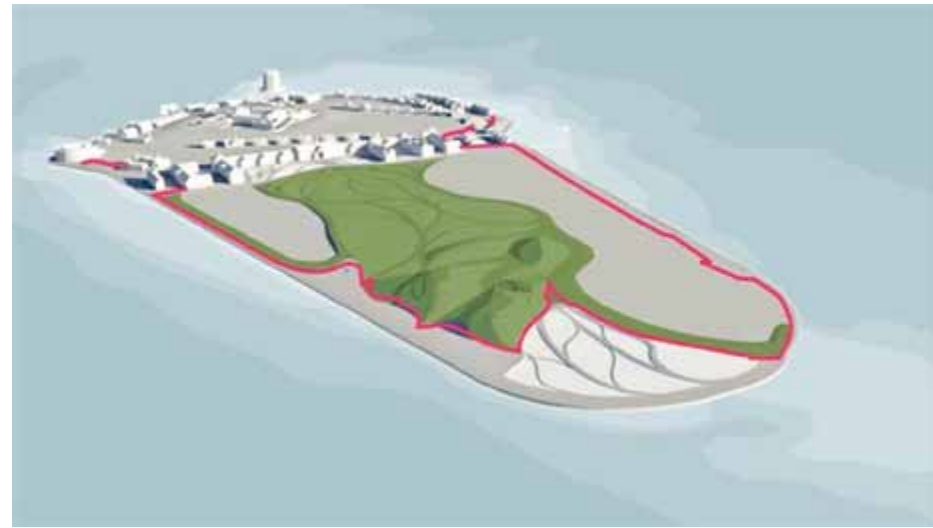
Proposed topography raises planting above projected flood line